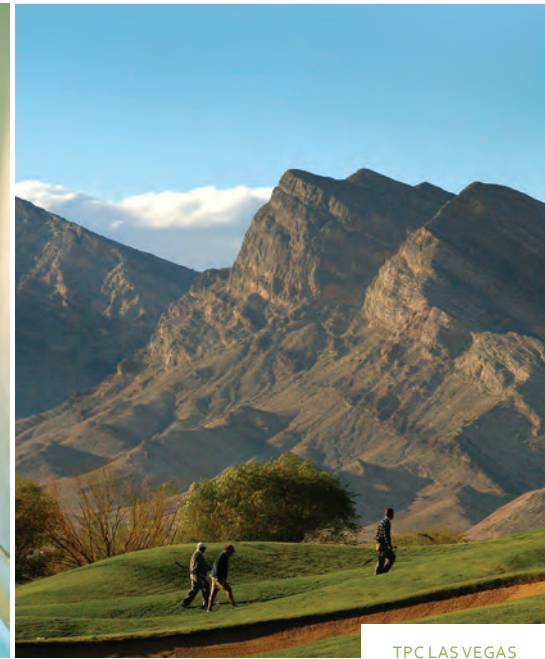
TPC LAS VEGAS